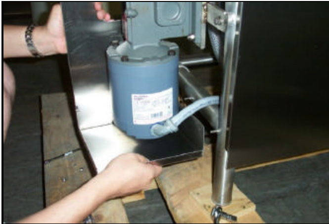
Removing the bottom cover.